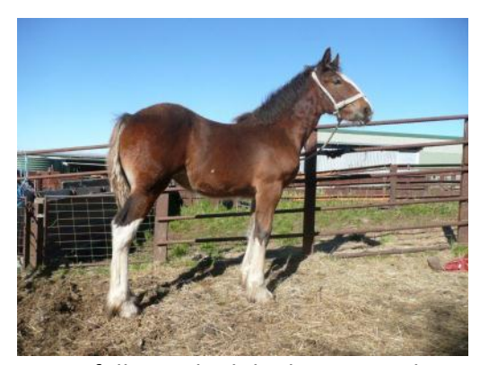
Beautifully marked dual registered Appendix A Shire filly, A20171 Aus, A1272 UK. DOB 27/10/10 $4000 delivered to Melbourne

Sire : Ingleside Dancer (out of 4 x Best Exhibit at Sydney Royal Ingleside Elizabeth, by Ingleside Might 'n' Power), a jet non-fading black stallion with amazing presence.