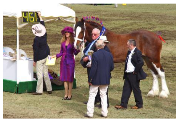
Shire Stallion, 4yrs & over