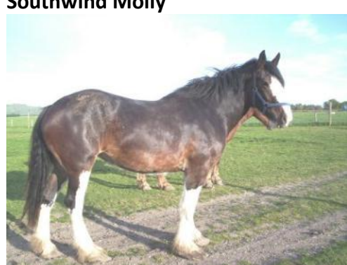
7year old dark bay/black mare. Molly is fully registered with the UK Shire assoc but cannot find papers. Full sister to Hermaine. Price NZ$10,000 (approx A$7,300)